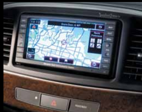
MITSUBISHI MULTI COMMUNICATION SYSTEM (MMCS)

Other features that do the thinking for you include Smart Key which provides key-less entry and operation, Dusk Sensing Headlamps and Rain Sensing Wipers.