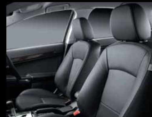
LEATHER TRIMMED SEATS